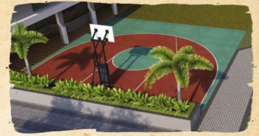
Basket Ball Court