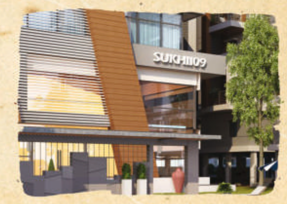
Sukhii Paradise (Clubhouse)